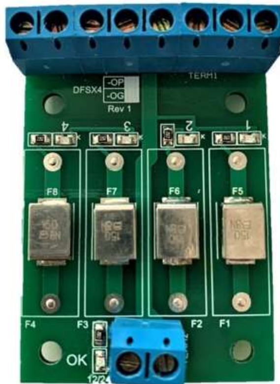
DFXS4-OP 4-way, self-resetting, electronically-fused output splitter

Dycon output splitters enable a single power supply unit to drive several different devices at the same time. The range consists of three different types of splitter that cover most system requirements. They take the dc power output from any Dycon, or most other make, 12VDC or 24VDC power supply and distribute it into four or eight protected outputs to drive peripheral systems components. The full range consists of an intelligent, electronically-fused 4-way, conventional glass-fused 4 and 8-way and a glass-fused unit with 4 x BNC loop-through video outputs for powering over-the-coax CCTV cameras each has two additional 1A conventional wired outputs. The DFXS4-OP, a four-output version ( shown above ), is protected by self-resetting, electronic fuses, each with a maximum rated output of 1.5A. These units have green LEDs to indicated when an output is powering normally.