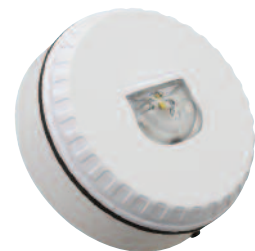
Solista LX Wall White