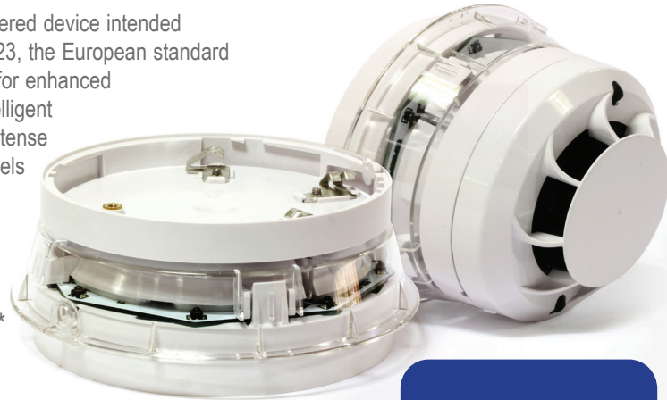
* Detector purchased separately

The EN54-23 Detector Base Sounder Strobe is a high quality loop powered device intended to alert building occupants of a potential fire. Approved to meet EN54-23, the European standard for Visual Alarm Devices, it utilizes the System Sensor B501AP base for enhanced installation flexibility and integrates seamlessly with System Sensor intelligent detectors. When triggered by the fire panel, its powerful sounder and intense strobe give a visible and audible warning. A choice of sound output levels and tones make the device suitable for a wide variety of applications.